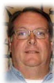
Chuck Hodge Communications