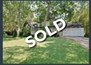
8138 San Benito