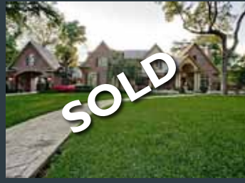
1409 San Rafael