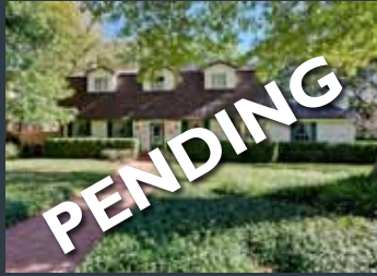
8212 San Cristobal