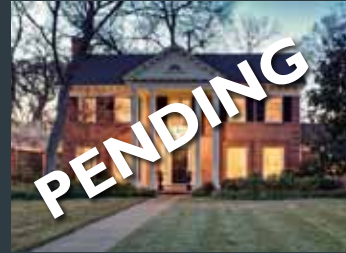
1417 San Rafael