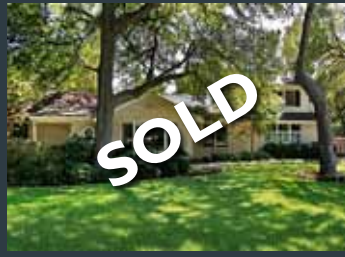
8130 San Benito