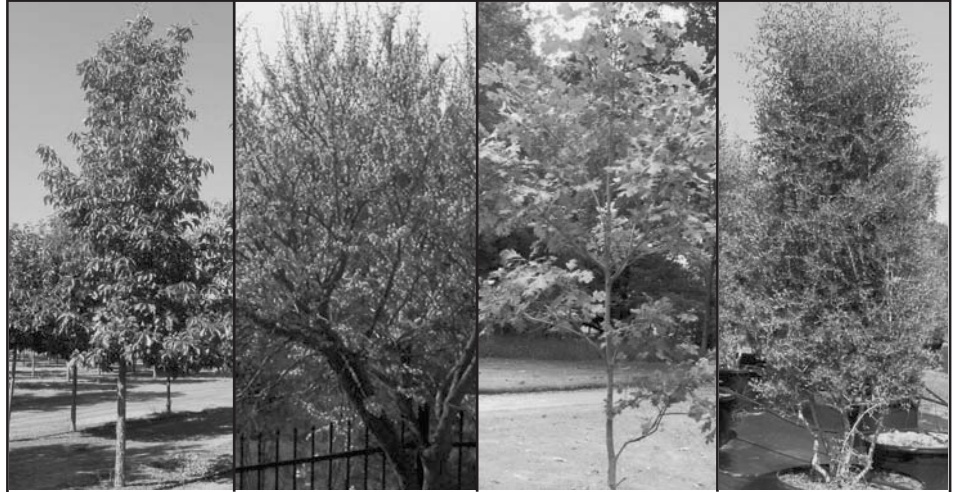
Chinkapin Oak, Redbud Tree, Shumard Oak, Yaupon Holly