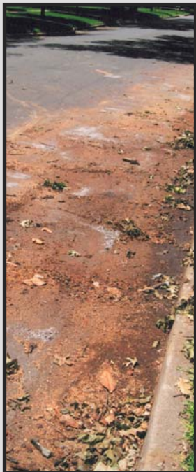
Dirty street in Forest Hills

There is plenty of attention being paid to code compliance on several fronts. The issues that