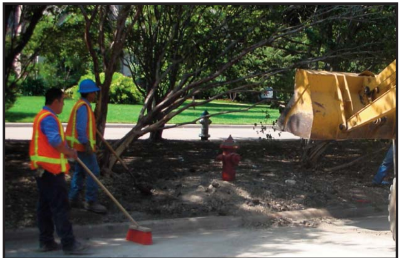
Crews Cleaning San Cristobal (below)