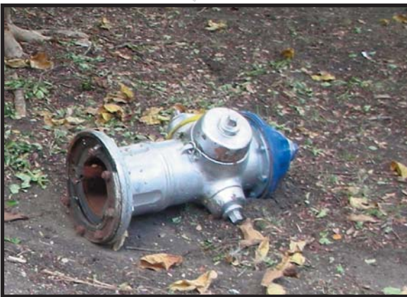
A drunk driver wiped out this fire plug. Rocky Bruener had it all repaired and tested in 5 days.

Please let us hear from you if there is a city related issue that needs to be resolved.