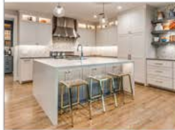
FEATURED: Clermont Street

Ring in the new year with a new kitchen.