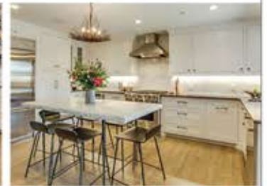
FEATURED: Bluffdale Drive