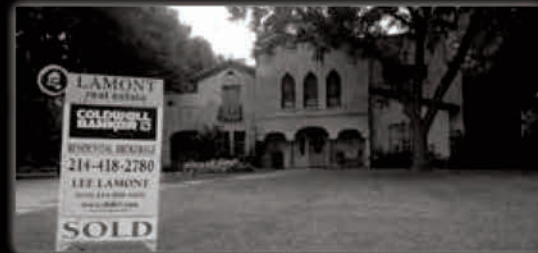
1406 San Rafael