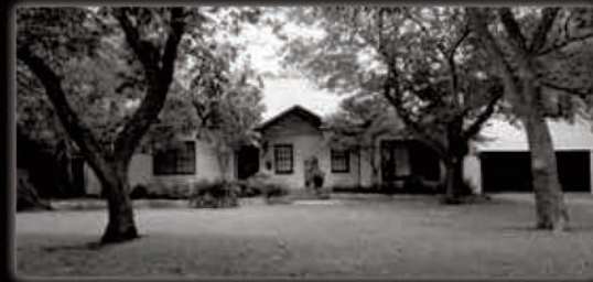
8366 Forest Hills Blvd.