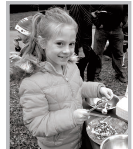
Fun pictures from FH Tree Lighting Festivities!!