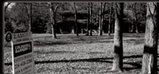
8255 Santa Clara