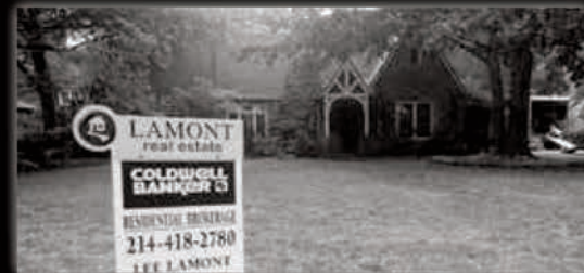
8130 Santa Clara