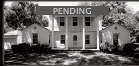
8525 San Fernando Way