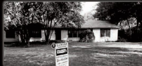
8215 Santa Clara