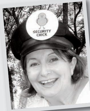
Ask the Security Chick