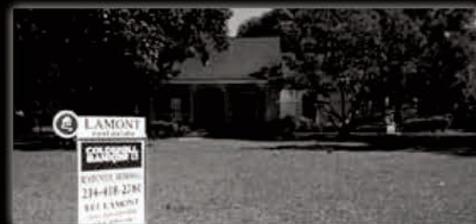
8438 San Fernando Way