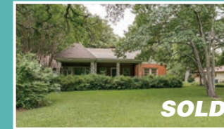
8100 Forest Hills - listed at $675,000