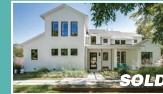
8538 San Pedro - listed at $1,195,000