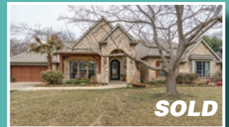
8531 San Pedro - listed at $1,160,000