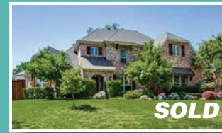
8515 Groveland - listed at $775,000