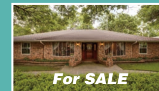
8110 San Cristobal - listed at $450,000