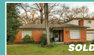
8502 Groveland - listed at $210,000