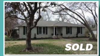
8380 San Cristobal - listed at $332,900