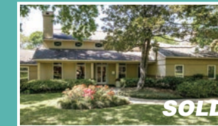
8125 San Fernando - listed at $1,295,000