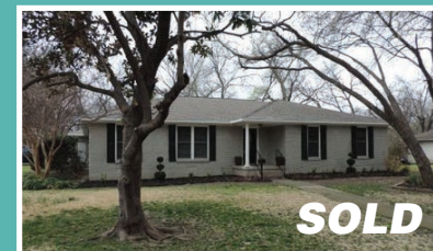
8380 San Cristobal - listed at $332,900