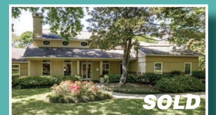
8125 San Fernando - listed at $1,295,000