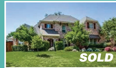
8515 Groveland - listed at $775,000

VICKI WHITE HOMES HAS LISTED AND SOLD 8 HOMES IN FOREST HILLS IN THE PAST 6 MONTHS!