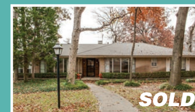
8214 San Leandro - listed at $435,000