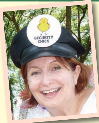
Ask the Security Chick