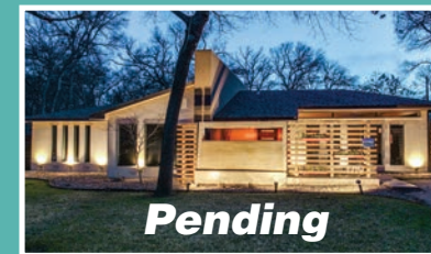
1719 Corday - listed at $389,900