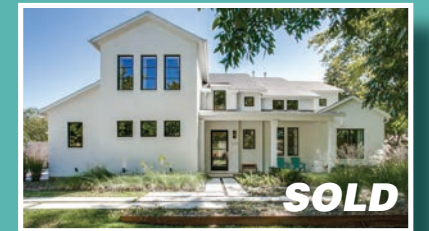
8538 San Pedro - listed at $1,195,000