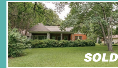
8100 Forest Hills - listed at $675,000