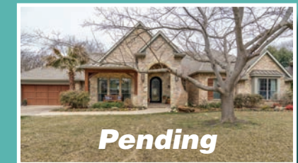
8531 San Pedro - listed at $1,160,000