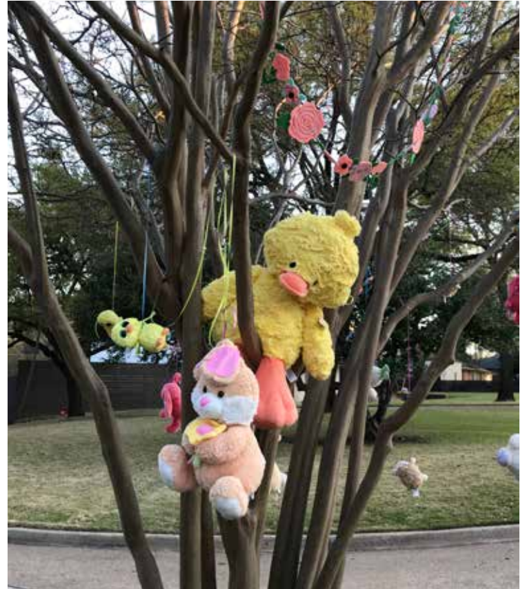
The Easter Tree that neighbors decorate each year. On the corner of Whittier and Santa Clara.

For more information & to volunteer email fhnasocial@gmail.com .