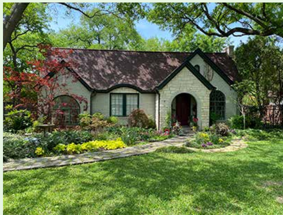
April 2021 Kathy & Woody Glenn 8325 Forest Hills Blvd.

This an amazing and diverse landscape to enjoy up close and personal. Kathy's "Flower Basket" at the front of the driveway catches the most sun. Charming stone paths that lead you through a shade garden around the front of the house, continue into the backyard revealing one surprise after another. There is a fire pit area, a waterfalled Koi pond,