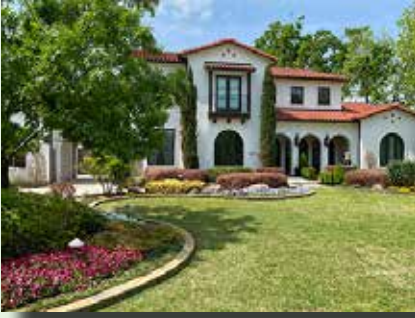
April 2021 Michael Ferguson 8417 Santa Clara Drive

Designed to mimic a California coastal landscape, this garden is filled with perennials that can withstand our Texas conditions. A distinctive modern walkway is noteworthy as is the pleasing fountain near the front door. The relatively new backyard features a luxurious covered patio that overlooks a fabulous pool with cascading waterfall topped by a fire pit, an arbored cabana and a realistic artificial turf surround.