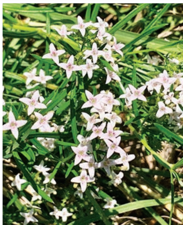
Bluets, Houstonia longifolia