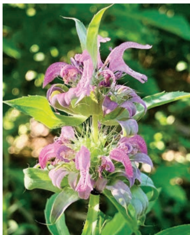
Lemon Beebalm, Mondarda citiodora