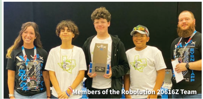
Members of the Robolution 20616Z Team

This past May, Alex Sanger Preparatory School had four of their five robotics teams represent the school and district at the Vex Worlds Robotics Competition held in Dallas at the Kay Bailey Hutchinson Convention Center. Three Middle School Robolution teams competed May 8-10 and an elementary team May 10-12. Each Middle School team had 10 qualifying matches in their divisions. Robolution 20616A ended their season ranked 40th out of 79 in the Arts division. Robolution 20616B ended their season ranked 26th in the qualifiers matches out of 78. Robolution 20616Z finished their qualifying round in the Spirit division ranked 9th out of 79, clinching a spot in their division finals for a hope to represent their division on the big tables for the overall finals. Though they didn't make it, they ended their division finals winning the Innovate Award, making this Sanger's first award at Worlds since the robotics team was started in 2016! The elementary team competed in the Innovate division ending their qualifying matches ranked 17 out of 57. They also were able to advance to their division finals, but also did not win to represent their division in the overall finals. Con-