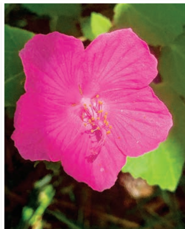
Rock Rose, Pavonia lasiopetala