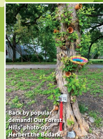
Back by popular demand! Our Forest Hills' photo-op: Herbert the Bodark.

Sunday, May 21st • 10:00 a.m. – 5:00 p.m.