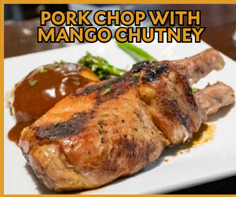
PORK CHOP WITH MANGO CHUTNEY