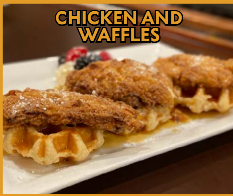
CHICKEN AND WAFFLES