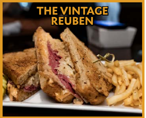
THE VINTAGE REUBEN