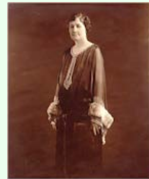
Miriam “Ma” Ferguson

Congress enacted the Indian Citizenship Act, which granted citizenship to all Native Americans born in the United States.