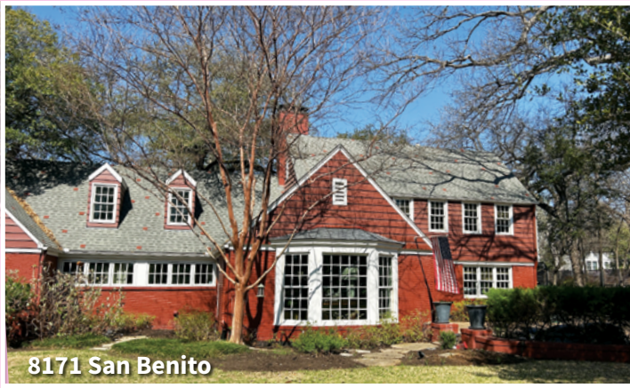
8171 San Benito

The Garden Tour is an event not to be missed. It promises to be a celebration of nature’s artistry, and a source of inspiration for experienced and novice gardeners alike. People from all over Dallas and North Texas come every year to “imbibe” in the beauty of the three neighborhoods, Forest Hills, Little Forest Hills and Casa Linda Estates. The garden selections this year were inspired by our Forest Hills Centennial Celebration and are featured in our Yard of the Month article. We are excited to tour the gardens of some of our oldest homes in Forest Hills.