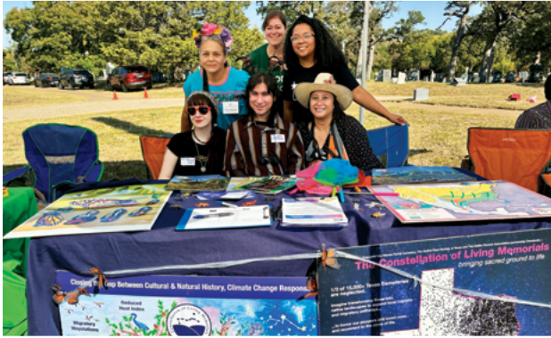
Friends of the Warren Ferris Cemetery expands its reach through the Constellation of Living Memorials two-year pilot program.

Forgotten cemeteries aren't just neglected spaces—they can become hotspots for drugs, vandalism and environmental issues that degrade property values. The Constellation of Living Memorials (CLM) addresses this issue by reclaiming and transforming these places. Featured in The New York Times , CLM models how abandoned cemeteries can reconnect us to our roots and communities, become ecological sanctuaries, enrich local economies, create jobs and attract visitors.