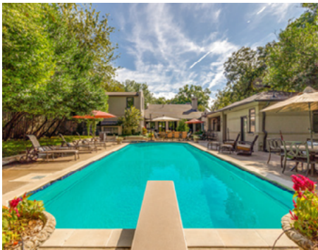
8125 San Fernando Way COMING SOON