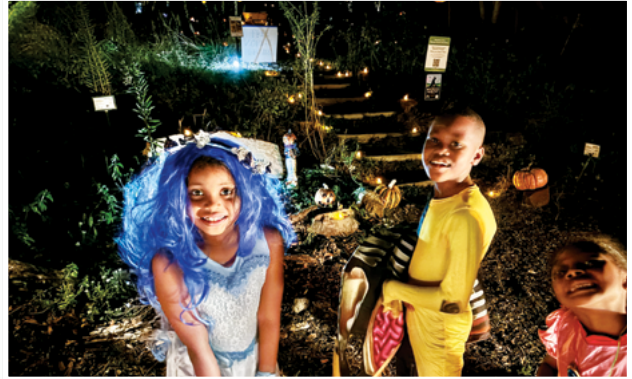
Halloween at the Ferris Cemetery, kids learn about nature in the Wildlife Sanctuary

Collaborations with Texas A&M AgriLife Extension programs brought in Master Naturalists and gardeners to guide conservation efforts and community education.