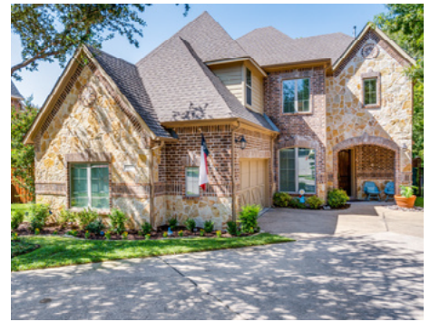
2238 Forest Hollow Park COMING SOON