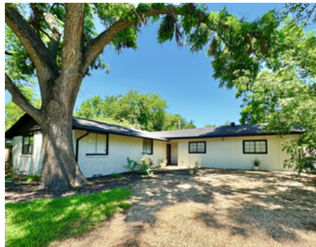
8543 Eustis Avenue COMING SOON